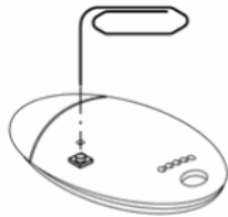
Old type Mitto